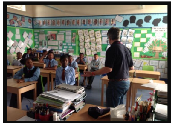
Ideas on how to travel safely