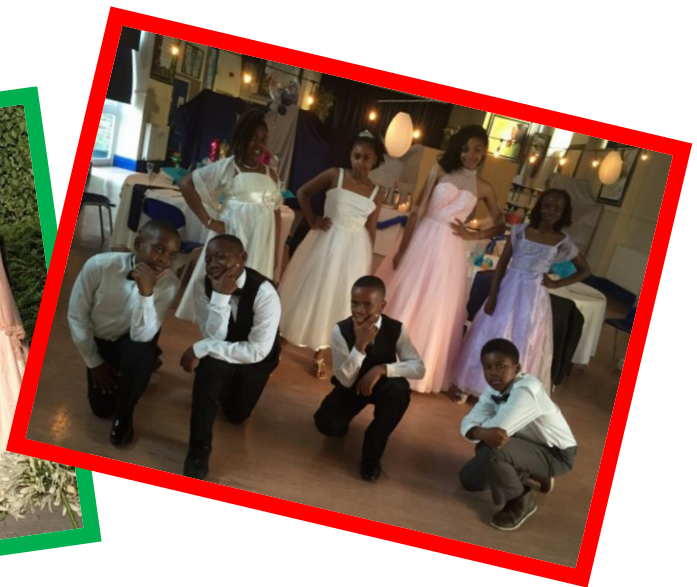
Year 6 Prom