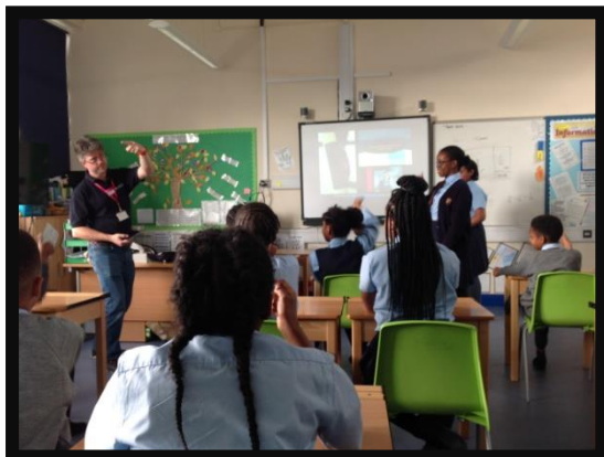
Transport For London